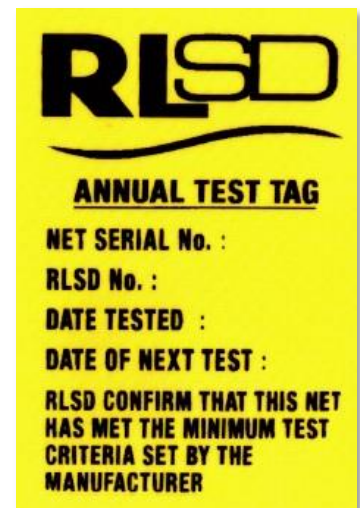
Figure 2. Example Test Tag

For more information about FASET, contact: