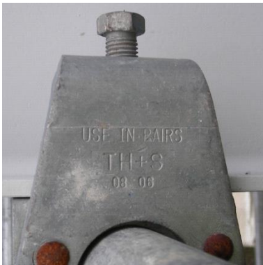
Figure 2. Correct use of a scaffold girder clamp

Scaffold girder clamps are designed to be used in pairs with a scaffold butt / tube attached between the two clamps, as shown in Figure 2 and Figure 3.