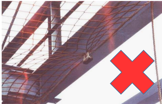
Figure 1. Incorrect attachment of a Safety Net

The practice of using single scaffold girder clamp - coupler or part of them to attach or hook a Safety Net to the bottom flange of a beam or similar structure is prohibited. Safety Nets must not be installed as shown in Figure 1.