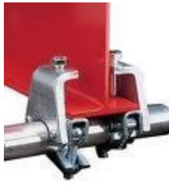
Figure 2. Correct use of a scaffold girder clamp